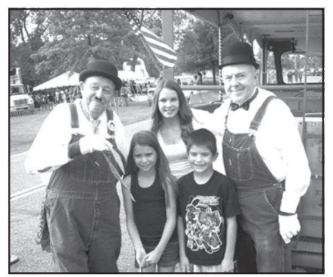
Look-A-Likes and Kids