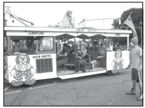
Tommy the Trolley and the Grotto Gang