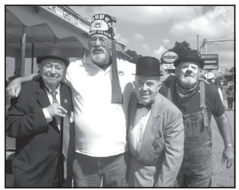
Hey! You Guys Standing in a Hole?