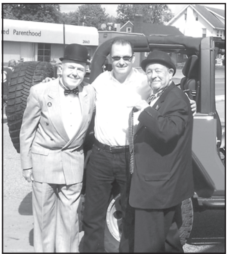
Look-A-Likes at H.O.F.