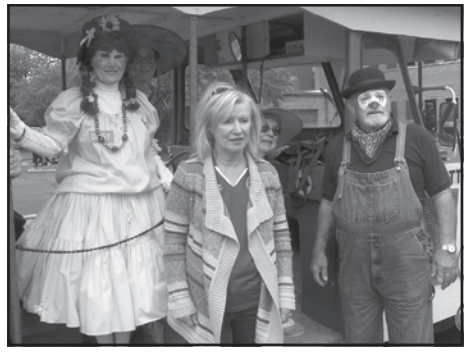
In Costume on Line and Ready to Go