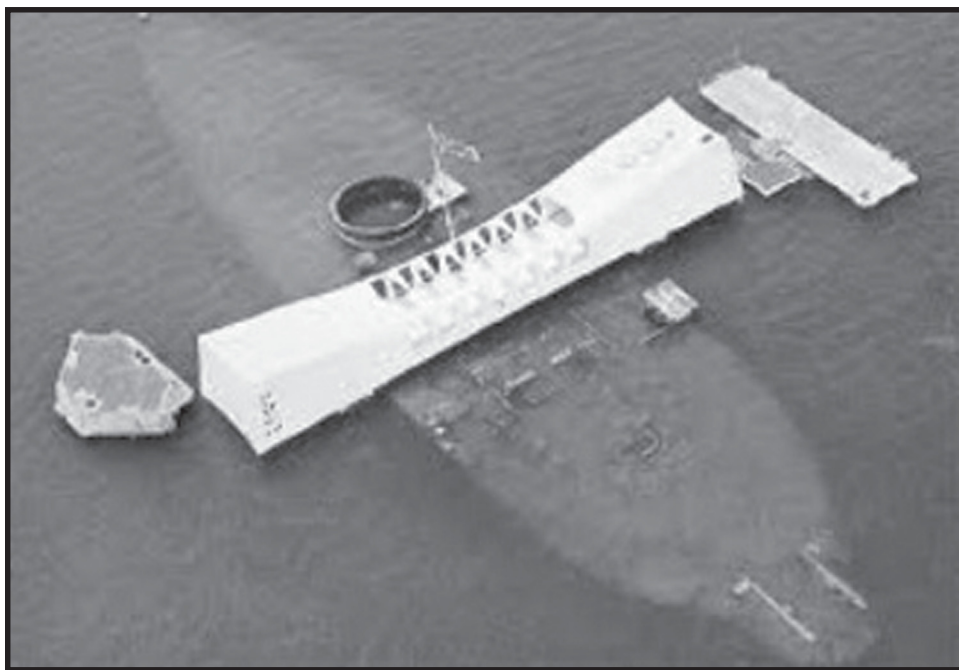
Pearl Harbor Memorial

The Date of Infamy that launched an epic conflict with Japan took place here in the early morning hours of December 7, 1941. The tranquil waters of Pearl Harbor were forever disrupted by the tides of war. The USS Arizona and 1,177 of her crew were among the first casualties of the Pacific War; the USS Arizona Memorial stands above the sunken vessel and her fallen sailors, serving as a reminder of their sacrifice and commitment.