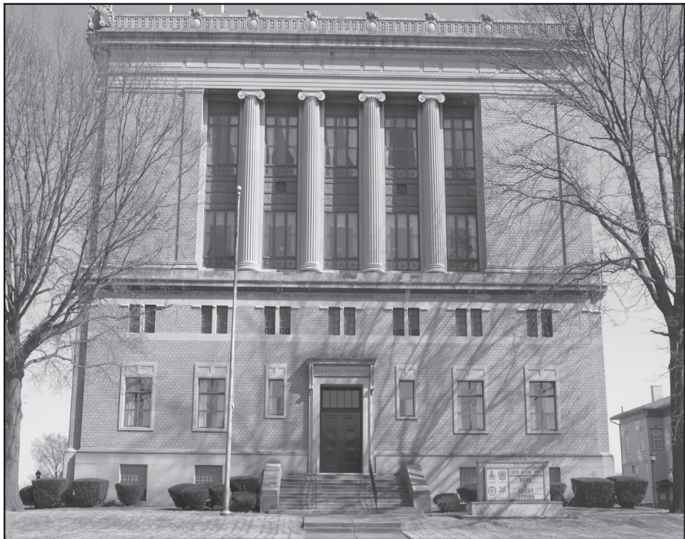
Masonic Temple, Canton, Ohio