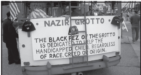
The Black Fez