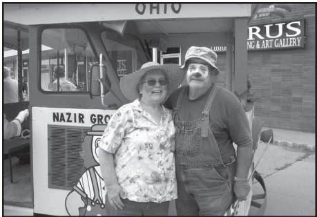
We got 'er ready Mom