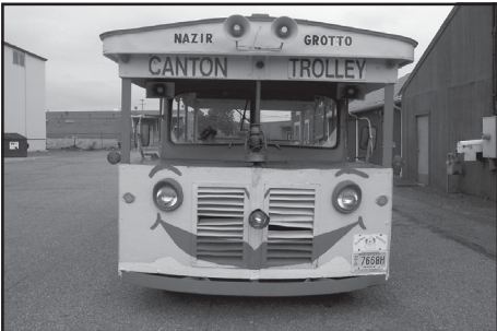
Old Tommy needs a Dentist!