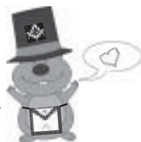
Wor. Bro. Punxsutawney Phil