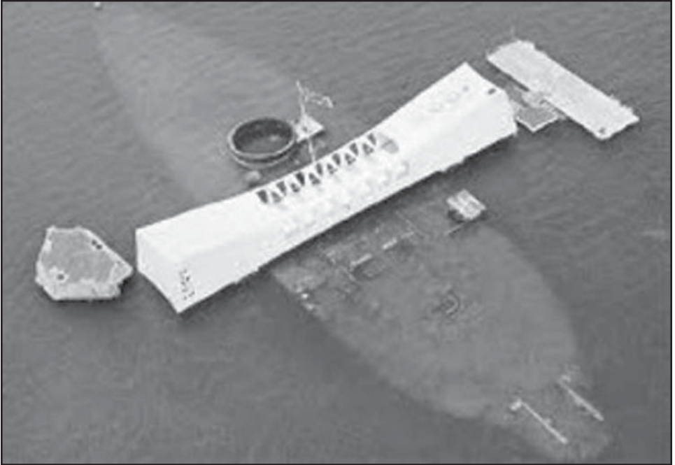
Pearl Harbor Memorial

The Date of Infamy that launched an epic conflict with Japan took place here in the early morning hours of December 7, 1941. The tranquil waters of Pearl Harbor were forever disrupted by the tides of war. The USS Arizona and 1,177 of her crew were among the first casualties of the Pacific War; the USS Arizona Memorial stands above the sunken vessel and her fallen sailors, serving as a reminder of their sacrifice and commitment.