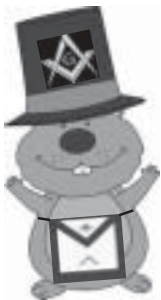
Wor. Brother Punxsutawney Phil