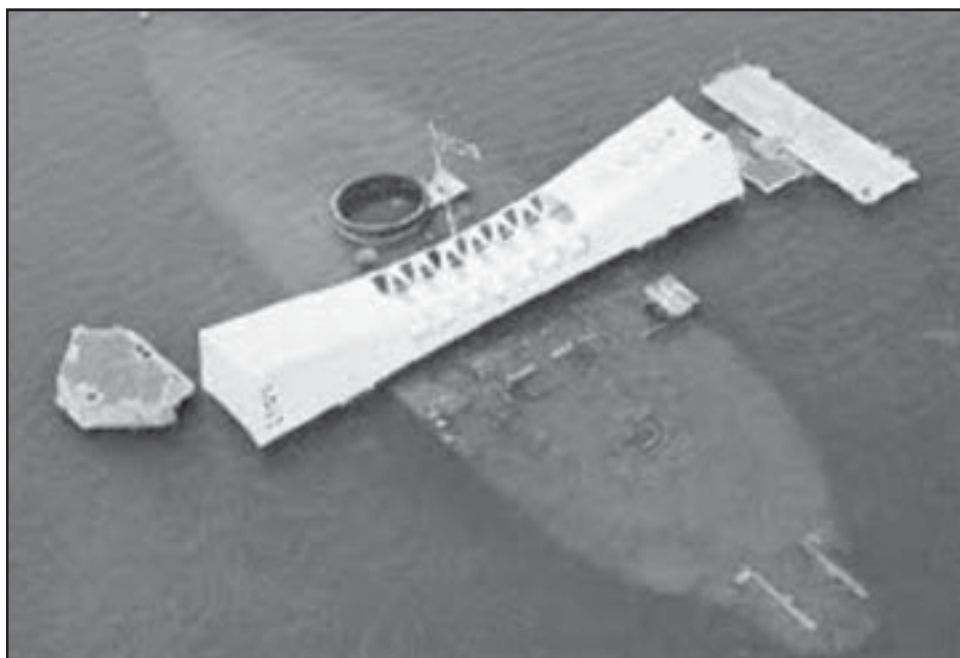
Pearl Harbor Memorial