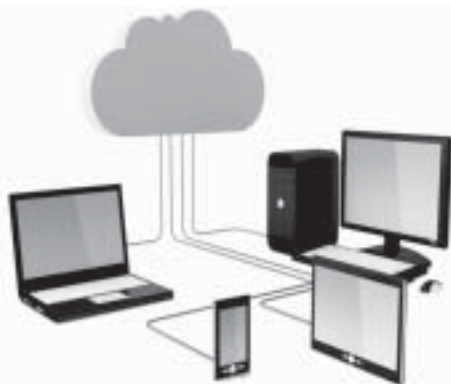
Social Media Cloud

under the impression the rogue remarks are the opinion of the organization or a member of it. These outside comments may or may not be against or for, the proliferation of Masonic principals, beliefs and edits. This could be dangerous leading to a confused public about the motives of this organization in general. The news media publishes daily stories of people, misguided youth in particular, being misled by “social media” leading to rape, leaving home and even death. Therefore my