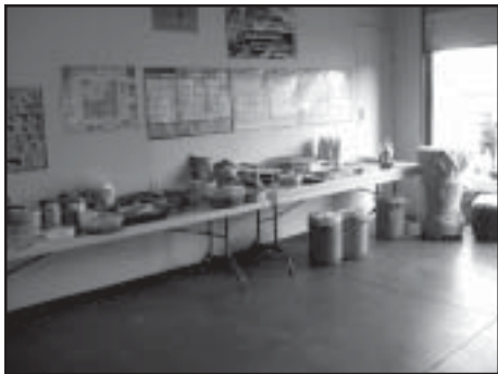
Inside Food Table 2019