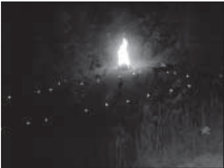
After Lodge 2019