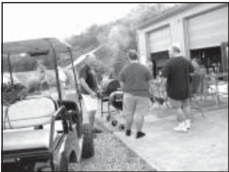
Cook at Work 2019

Perhaps next year will prove to be more successful in terms of visitors! Bobel 🎵