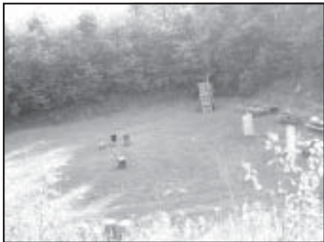
Before Lodge 2019

to feed most of the 21 st Masonic District, the candidate had a really good experience, the lecture and charge beside the roaring bon fire were a real challenge, the tyke lighting surrounding the lodge area was unique and everything, even the Fellow Craft Team did a great job with the exception of one noticeable factor; there were very few visitors. Where were you? The menu had kabobs, hot dogs, hamburgers, potato salad, mac. Salad, chicken, tossed salad, brownies, cake, cherry and apple pie, cookies and the only thing missing was ice cream. The iced tubs had every kind of soft drink your heart desired with no one to drink them. Yes...where were you? Greemport Tactical is really a great venue to support this type of Masonic function because of its unique surroundings and easy security. There is good parking, a great picnic area, porta-potties and Bill Bird opens his place with out stretched arms welcoming you and the weather was great. So; where were you? You missed a great outing!