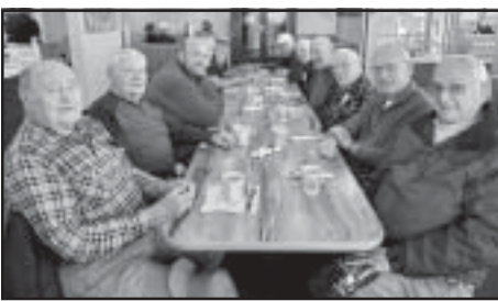
Retired Old Men Eating Out "ROMEO's"