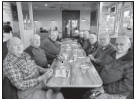
Friday Morning Breakfast Club