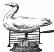
Goose and Gridiron