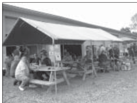
Outdoor Lodge 20 22