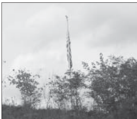
Outdoor Lodge 2022 Opening with Old Glory