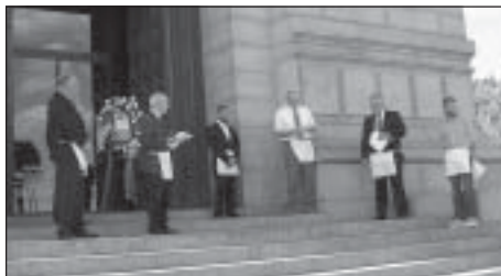
McKinley Observance Laying of the Wreath Ceremony