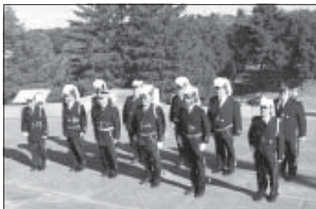
McKinley Observance 2022 Commandery No. 38 Posting of Colors