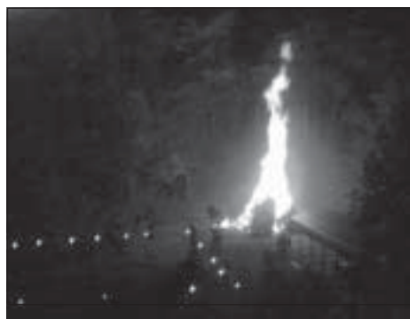
Outdoor Lodge 2022 Bon Fire Going Strong