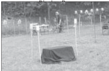
Outdoor Lodge 2022 The Altar

Highlights of: Masonic Outings in September above. Mother Nature cooperated and all enjoyed grand Fellowship.