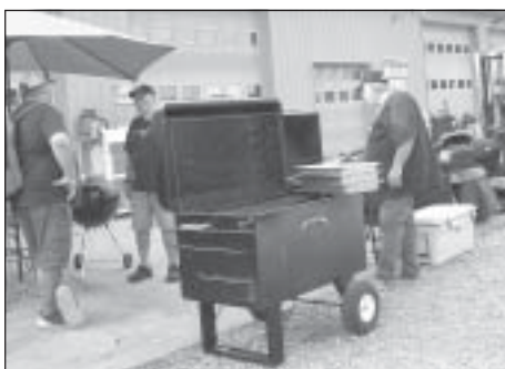
Outdoor Lodge 2022 Kitchen